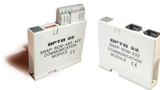
SNAP Serial Communication Modules

Both SNAP serial communication modules work with SNAP PAC Ethernet-based brains and rack-mounted controllers, both standard wired models and Wired+Wireless™ models. (They do not work with serial-based SNAP PAC brains.) These modules snap into Opto 22 SNAP PAC mounting racks right beside digital and analog