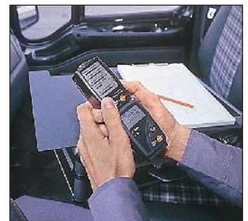
Reset and reboot on-site