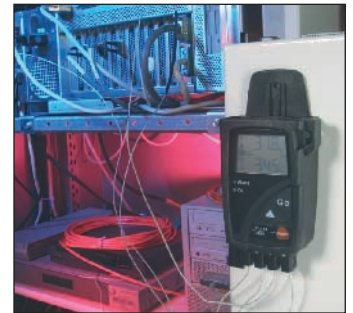
Log temperatures in computer systems (e.g. hospital)

Fluctuations in temperature e.g. in production processes, in laboratories etc. often influence the overall result. Surface, immersion and air probes enable adaptation to the respective measurement task.