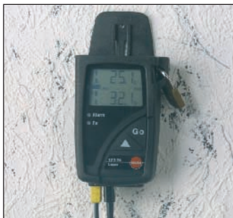
Wall holder, for fast attachment of logger to wall