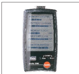
testo 580 data collector including readout holders

ComSoft 3 - Basic Set for testo 177, incl. interface, desk-top holder, PC connection cable