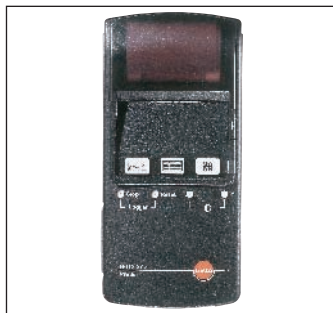
testo 575 fast printer, incl. 1 roll of thermal paper and batteries