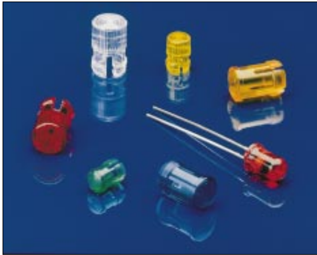
U.S. & Foreign Pat. Pend.