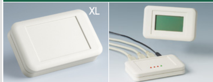
Four Useful Sizes