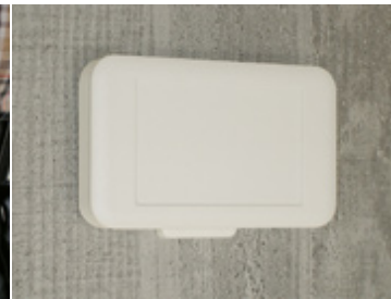
Combi-Clip - Wall Clip