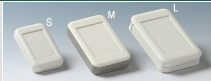
Ergonomic Design - Great to hold!