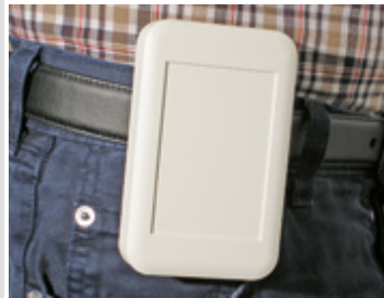
Combi-Clip - Belt Clip