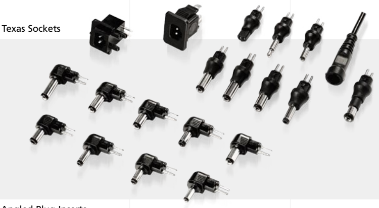
Angled Plug Inserts

In addition to the standardized low voltage plug-in connections such as coaxial (in accordance with DIN 45323) and jack connectors (in accordance with DIN 45318), FRIWO also provides customized connecting cables. The wire diameter which is generally used in our units ranges from 0.25\ \text{mm}^2 to 1.5 mm<sup>2</sup>. Both flat and round cables can be used.