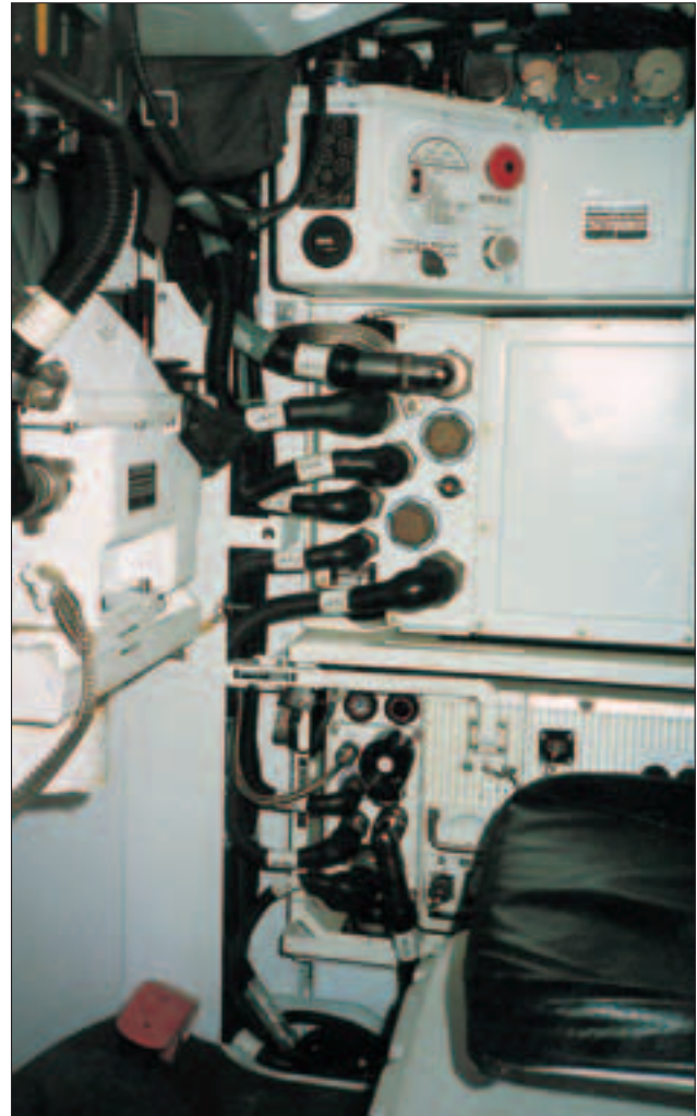
Space saving right-angle shapes used here in a military application.