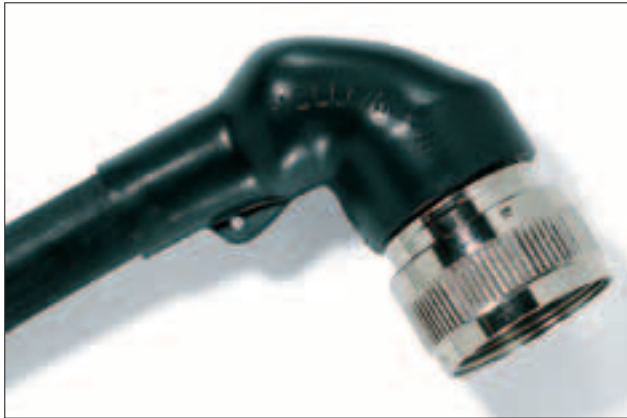
1152-4-G recovered on to a connector.