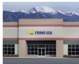
North America, Colorado Springs