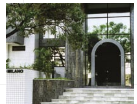
South America, São Paulo