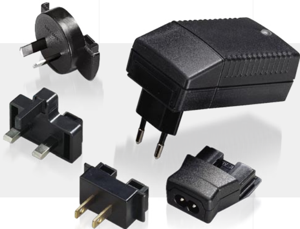
MPP 15 Medical