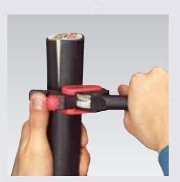
Turning the tool for circular cut