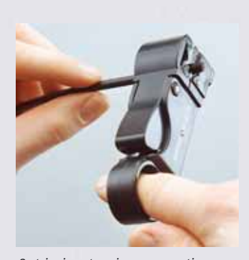
3 stripping steps in one operation