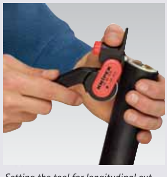
Setting the tool for longitudinal cut

Article-No. EAN-Handles Stripping capacities Length Code mm 4003773 ø Inch g 16 40 150 026709 fibreglass reinforced polyamide for round cables over 25.0 1.0 210 16 49 150 026716 spare blade