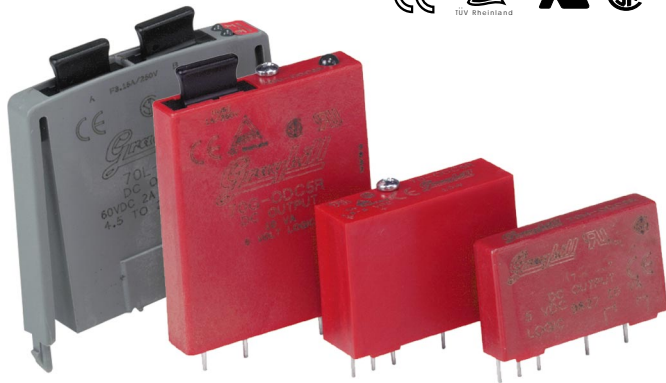
70L-ODC5R 70G-ODCR/OACRLY 70-ODCR/OACRLY 70M-ODCR