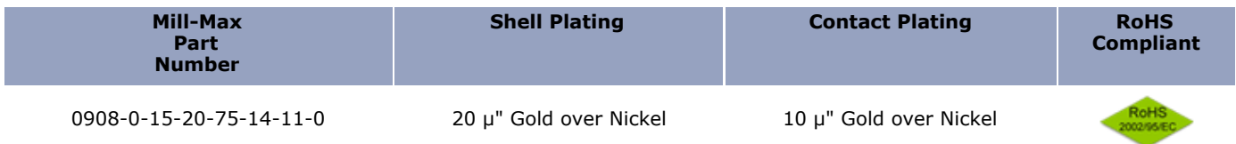
0908-X-15-20-75-14-11-0 Standard Stroke Solder mount in .018 min. mounting hole