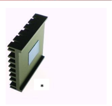
All ABL's BGA heatsinks are supplied with thermal tape