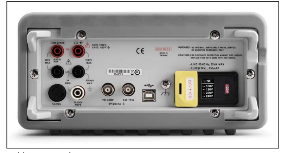
Model 2100 rear panel

1.888.KEITHLEY (U.S. only) www.keithley.com