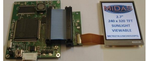
Example of use