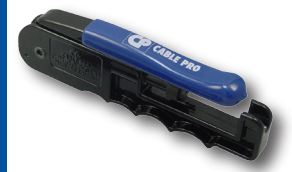
CPLCCT-SLM Utilize This Tool

The FS6U is our Universal "F" type connector that fits most RG6 standard, tri-shield, and quad-shield coaxial cable.