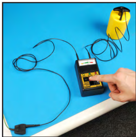
Figure 3. Using the test leads and one 5 pound electrode to measure Rg

CAUTION: If there is a current limiting resistor in the worksurface and the worksurface resistance is lower, the measurement will primarily be the resistance of the resistor. It is recommended to measure Rp-p particularly if the material color is black.