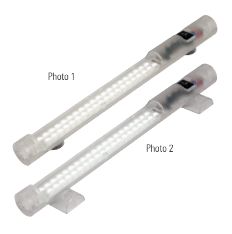
Photo 1: Lamp LED 025 with magnet fixing Photo 2: Lamp LED 025 with screw fixing