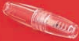
FX0180, FX0280, FX0380