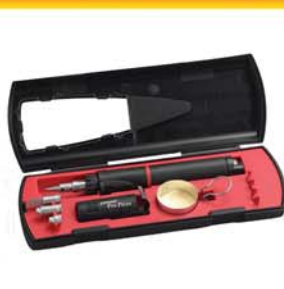
Pro Piezo Kit