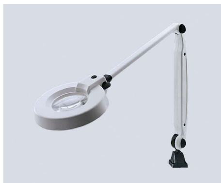
RLL 122 T