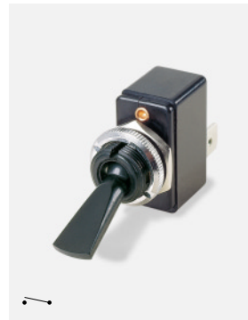
C0600HD - - -

3mm contact gap Technical data on pages 4 & 5