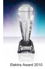
Elektra Award 2010