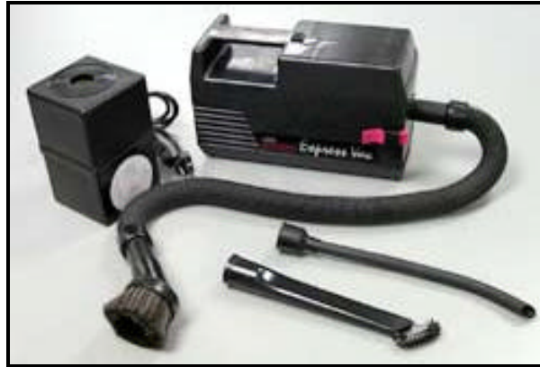
EXPRESS CARTRIDGE VACUUM

POWERFUL. Atrix has built in a new, powerful motor making the Express Plus as powerful as most of the larger service vacuums.