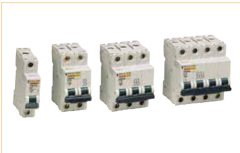
1, 2 and 3 pole Type D Miniature circuit breakers