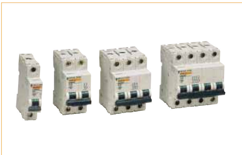
1, 2, 3 and 4 pole Type C Miniature circuit breakers