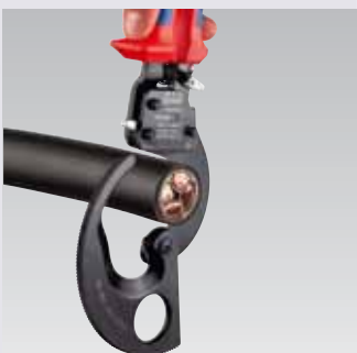
95 31 280: large cutting capacity: maximum 52 mm dia. / 380 mm 2