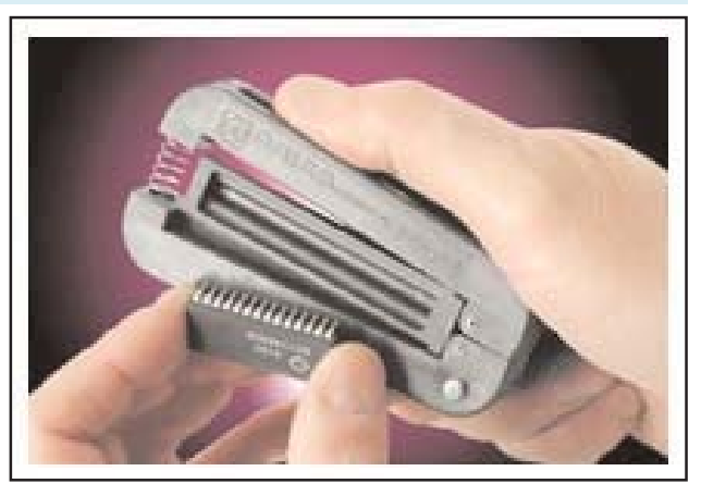
Note: Aries specializes in custom design and production. In addition to the standard products shown on this page, special materials, platings, sizes, and configurations can be furnished, depending on quantities. Aries reserves the right to change product specifications without notice.