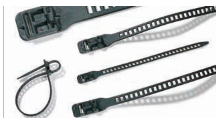
The Elasticity of the SOFTIX ties makes them suitable for use in many applications.

The SRT range offers solutions to numerous bundling applications. The soft, flexible material makes these ties particularly suitable for use on data and fibre-optic cables. The elasticity of the material makes them ideal for securing young trees to support poles, and other applications within the gardening and landscaping industry.