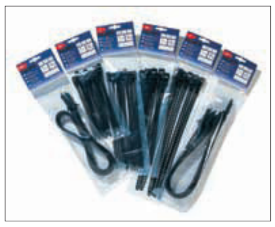
SOFTFIX ties available in small quantities.