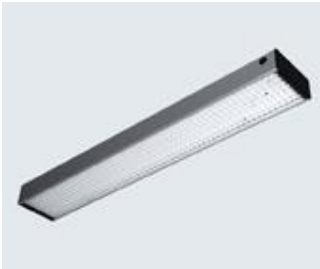
CERTO - CER 236

connected load fitted with work equipment mains lead luminaire body material surface luminaire base form weight (net) fastening technology usage glare-free class of protection colour luminaire body article no.