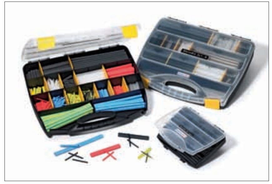
The right tubing size at hand for any application: ShrinKit 321 Universal, ShrinKit 321-A and ShrinKit 321 Basic.

This kit contains a range of general purpose tubing lengths clearly sorted in various sizes and colours. Its ideal shrink ratio of 3:1 replaces many differently sized tubings. The application range from 1 mm to 20 mm can be covered with ShrinKit 321 Universal.