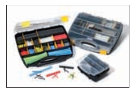
The right tubing size at hand for any application: ShrinKit 321 Universal, ShrinKit 321-A and ShrinKit 321 Basic.