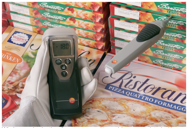
Wireless probe (optional) means an end to problems associated with cables