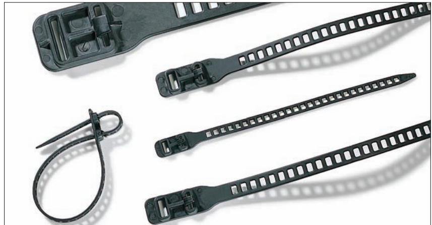
The Elasticity of the SRT ties makes them suitable for use in many applications.

The SRT range offers solutions to numerous bundling applications. The soft, flexible material makes these ties particularly suitable for use on data and fibre-optic cables. The elasticity of the material makes them ideal for securing young trees to support poles, and other applications within the gardening and landscaping industry.