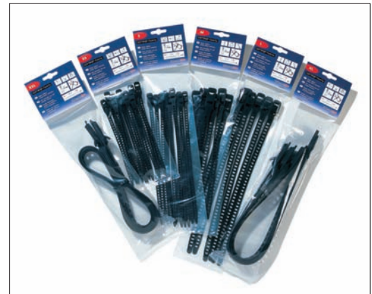
SRT ties available in small quantities.

All Dimensions in mm. Subject to technical changes.