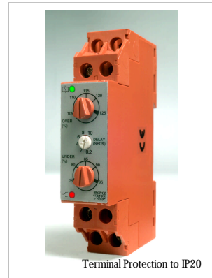
Terminal Protection to IP20