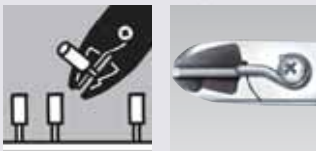
77 22 115 round head, without bevel