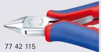
77 42 115 pointed head, without bevel