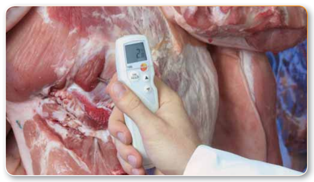
Testo 105 Hand-Held T-Bar Thermometer

Robust hand-held T-bar thermometer, with interchangeable measurement tips, for control measurements in abattoirs, refrigerated storerooms and meat processing.