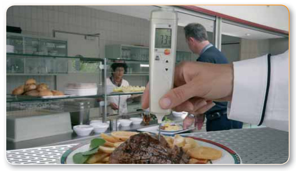
Testo 106 Ultimate Penetration Thermometer

Testo's ultimate penetration thermometer is ideal for quick and uncomplicated core temperature checks in all areas of food production, preparation and storage.