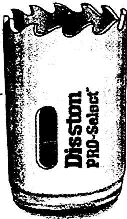
Carbide Tipped PRO-Select Deep Cut