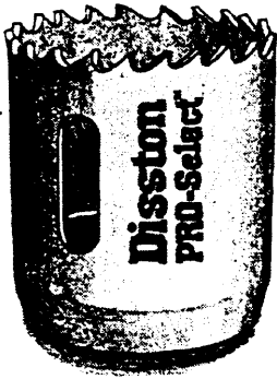
5000 SERIES PRO-Select Bi-Metal 4/6 Variable Tooth Design - Fast cut