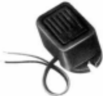
EMX-300L 1 SERIES