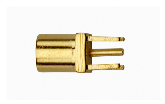
Model 73039 MMCX JACK STRAIGHT EDGECARD