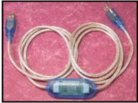
USB Link/Network Cable