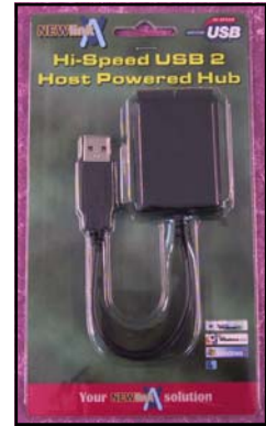
NLUSB2-202 Retail Packed.