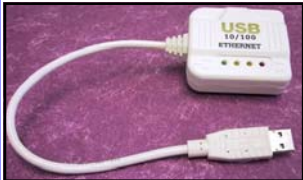
USB Ethernet Adaptor 10/100 Mbps

The NEWLink USB 2.0 External Bus Powered Hubs are ideal for connecting low powered USB Devices, they are primarily designed for use with Laptop computers, but can be used with desktop machines.