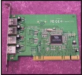
USB Host Cards (PCI)