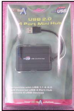
NLUSB2-204 Retail Packed.