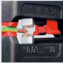
Precise stripping prevents damage to the conductor