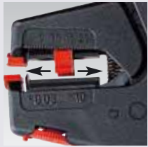
Adjustable length stop