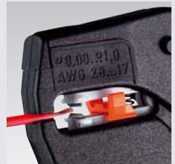
Adjusts automatically to the respective cable cross-section from 0.08 - 1.0 mm 2