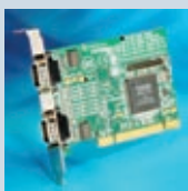
UC-257: uPCI 2xRS232