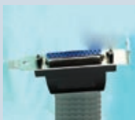
CC-032 LPT Adapter Cable