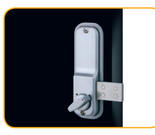
CL100 Surface Deadbolt Silver Grey finish only