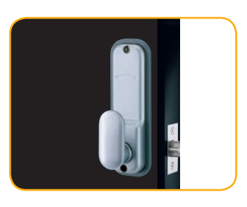
CL150 Mortice Latch