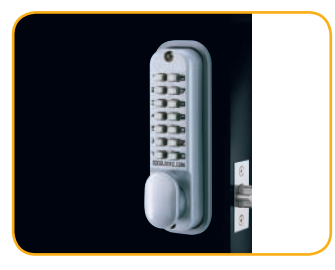
CL190 BB Mortice Latch Back to Back Silver Grey finish only