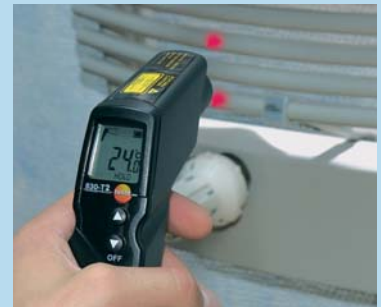
Reliable measurements with laser sighting