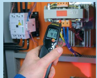
Measurement on live or moving parts