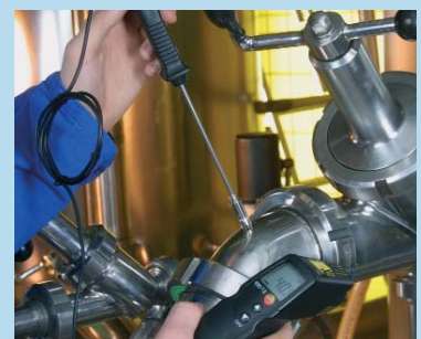
Connection for external temperature probes (testo 830-T2)