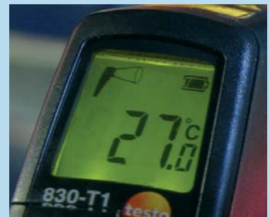
Easy-to-read display with illumination