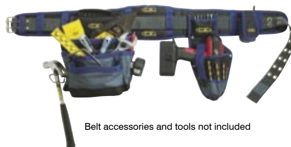
Belt accessories and tools not included