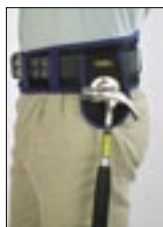
Belt and tools not included