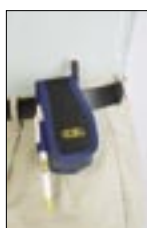
Belt and tools not included