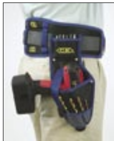
Belt and tools not included