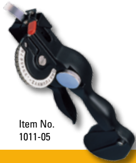
Item No. 1011-05