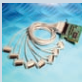
UC-275 uPCI 8xRS232 DB25