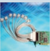
UC-279: uPCI 8xRS232