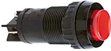
Pict.: with red lens