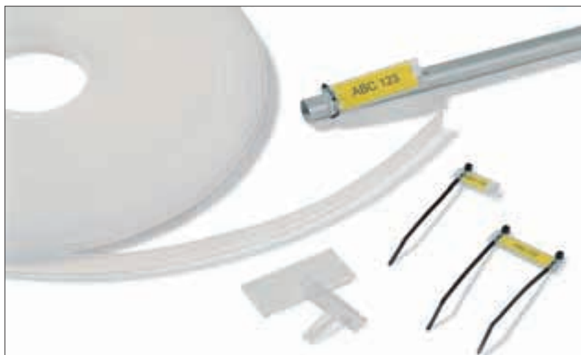
Multi-purpose identification potential: Helafix HC and HCR.

Marking of cable looms, cables, pipes, transport systems, valves, sensors, for inventory marking on machines or other parts.