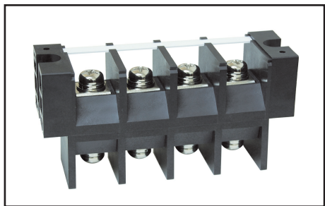
OTB-488 with marker strip installed