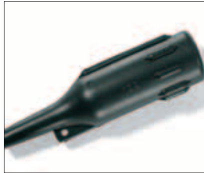
Recovered 199-4-G, VG style shape for small audio connectors with external ribs for improved grip.

Straight plug-and-socket connector terminal casing. This style is used in conjunction with circular grooved adaptor, providing protection against environmental stresses. The inside lip has been designed to provide extra reinforced stress relief. Special fitting 199-4-G for audio plugs has external ribs for an improved grip.