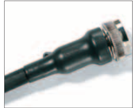
150 series boot recovered on to connector.