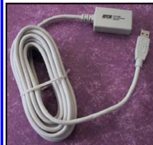
USB Line Extender