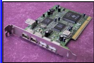
USB & FireWire Combo Host Card (PCI)