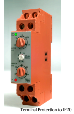
Terminal Protection to IP20